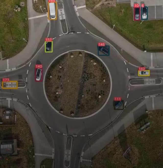
Figure 5. The roundabout picture shown in Figure 3 processed by the YOLOv8 model and the proposed system.