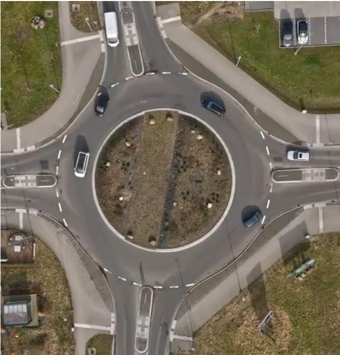
Figure 3. An aerial picture of the same traffic roundabout shown in Figure 1 after 1 second.