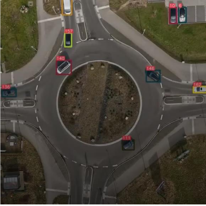
Figure 2. The roundabout picture shown in Figure 1 processed by the YOLOv8 model.