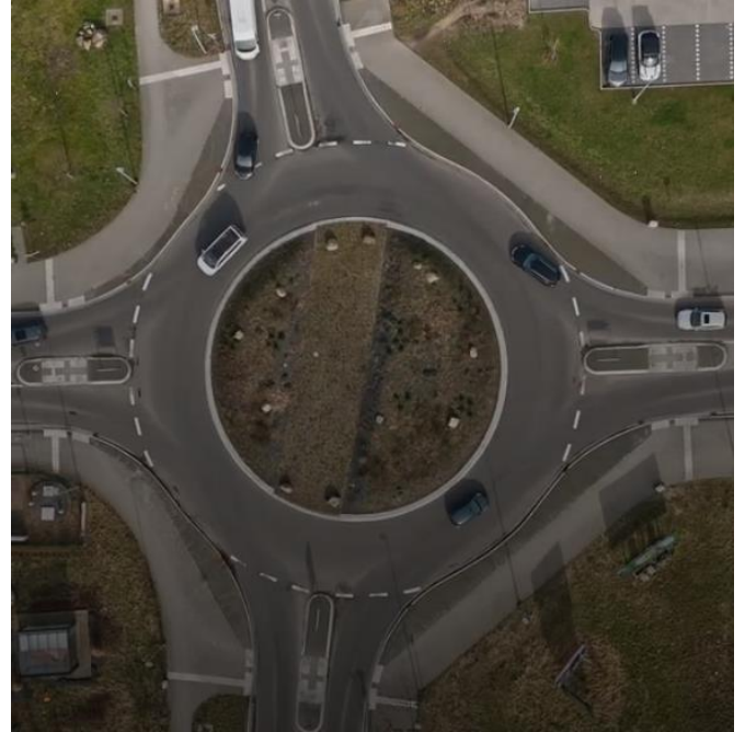
Figure 1. An aerial picture of a traffic roundabout.

Due to the recent advancements in machine learning and computer vision technology, it is now possible to automatically extract valuable information from images or video streams. In other words, it is possible for a computer-vision based system to identify the numbers and the locations of vehicles entering